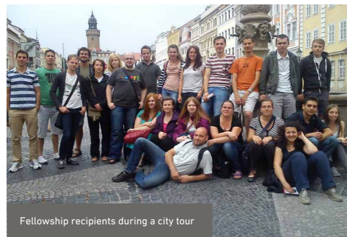
Fellowship recipients during a city tour