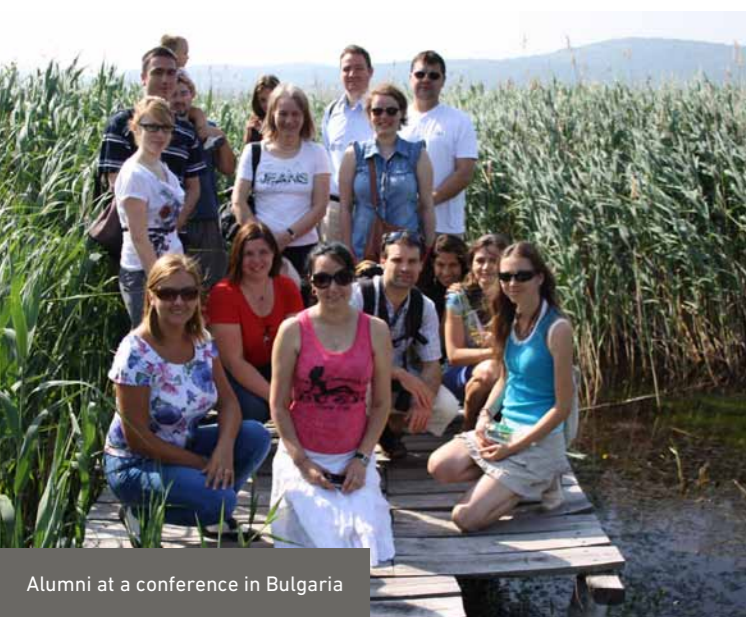
Alumni at a conference in Bulgaria

DBU coaches its fellows during the whole stay. During seminars the fellowship recipients can present their topics and their results and network with each other. Furthermore, DBU welcomes and supports individual initiatives to organize further professional events and seminars.